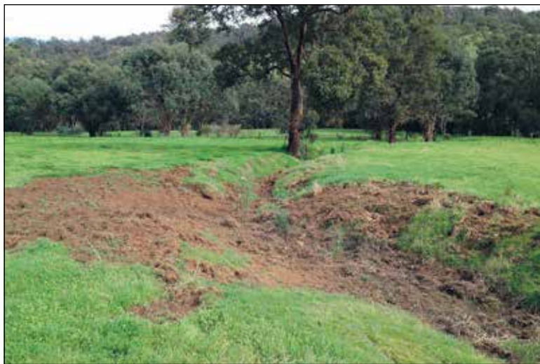
Damage caused by the feral pigs.

SINCE colonisation, feral animals have had a significant negative impact on Australia's biodiversity and natural environment.