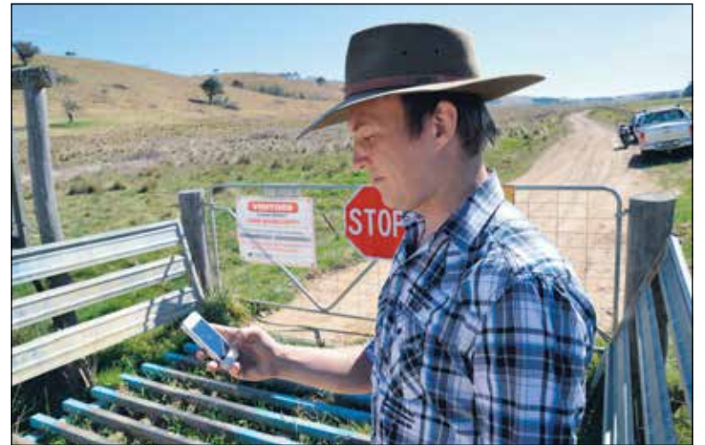
The FarmBiosecurity mobile app makes it easier for producers to incorporate farm biosecurity into their everyday activities.

In 2017, the project's work was formally recognised at the