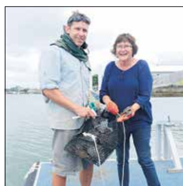
Project leader delivering oysters to an accredited oyster gardener.

Through this project the local community were educated on the ecological role of shellfish reefs, and recruited local residents to grow out oysters which have been used for experimental trials restoring shellfish reefs.