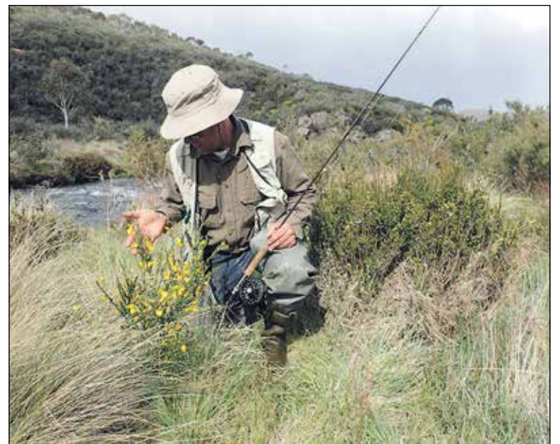
Flowering newly established Scotch broom.

Similarly, management of the nursery industry to prevent and enforce policies around bans on the sale of weeds of national significance will also make a significant contribution to reducing new infestations in the environment.