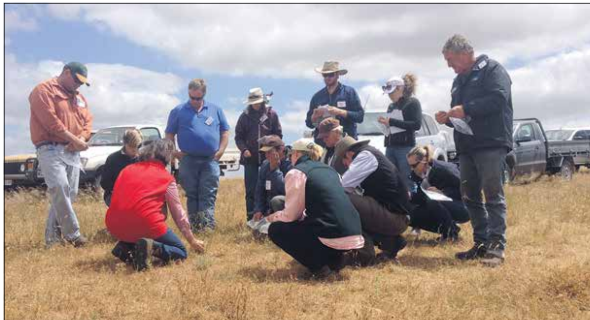
The Barossa Improved Grazing Group have seen value in learning from previous bushfire experiences.