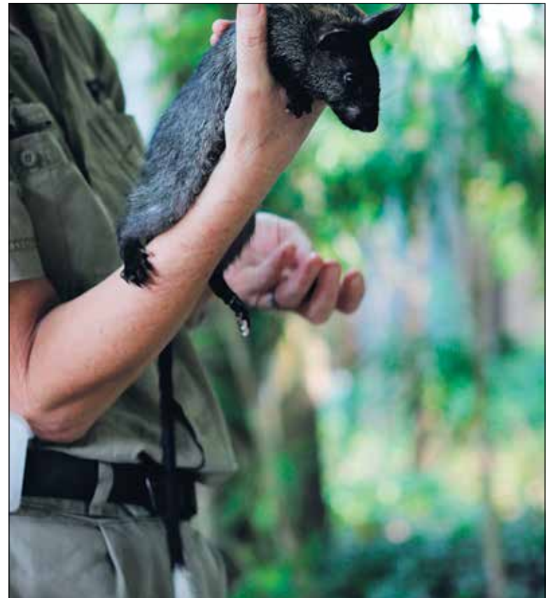
The endangered black-footed tree-rat found in the Northern Territory.