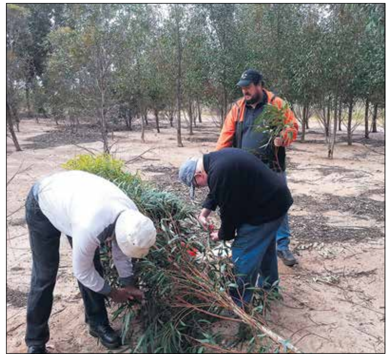
Members from the Farm Forestry Landcare Network collecting seeds to be propagated for planting in unproductive agricultural land.

"The possibility of making money is a huge incentive for farmers, but the benefit of this project to the environment and the genetic legacy of southern Australia is priceless."