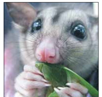
The endangered mahogany glider, found only in north Queensland.

• Email: julie.lightfoot@terrain.org.au or contact: 0427 039 117.