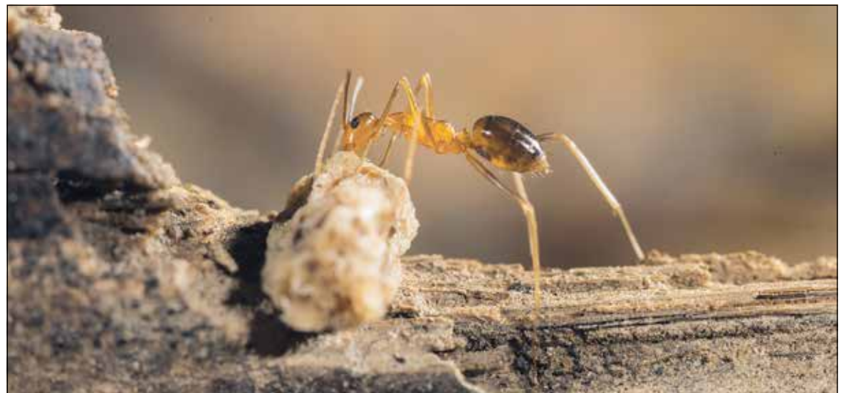
A yellow crazy ant ( Anoplolepis gracilipes ) sniffs a bait pellet.

Thanks to the joint funding arrangement, the Authority was able to grow the campaign to a team