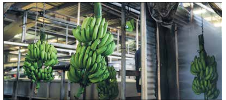
Bananas move along a conveyor belt during post-harvest quality control.

Since 1990, ACIAR has invested over $3.3 million in research aimed at minimising the spread of TR4 and its impact