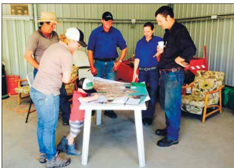
Yaven Creek Valley landholders discussing the proposed revegetation plans.

IT MAY only cover five hectares, but the Yaven Creek Rivers to Ridgelines project is bringing far-reaching benefits to the Riverina Highlands in New South Wales.