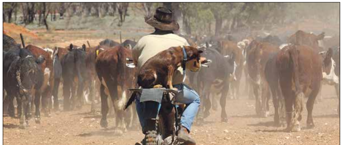
Livestock Biosecurity Network is focused on improving animal health, welfare, biosecurity and food safety across Australia's livestock industries.

We improve outcomes on-farm by developing educational material and delivering training for use on-farm and throughout the supply chain, as well as working one-on-one or in group