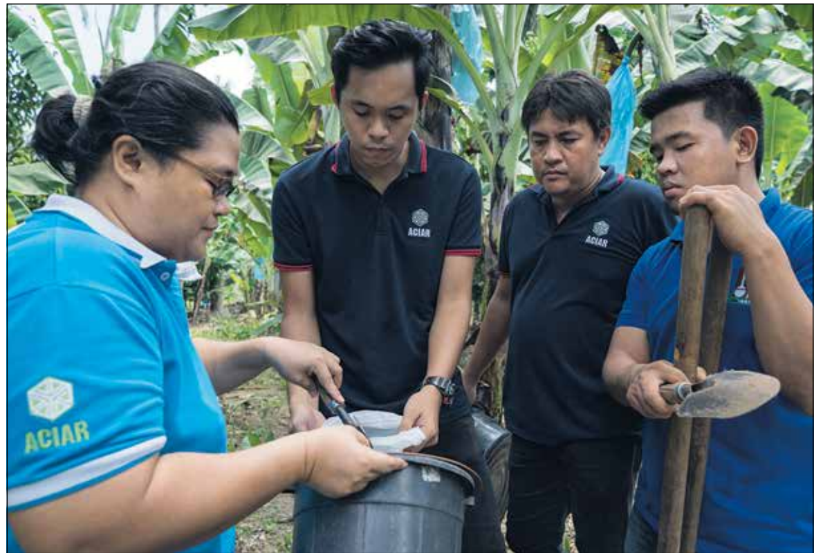
Researchers in the southern Philippines working on an ACIAR project.

"The project identified that the amount of TR4 inoculum