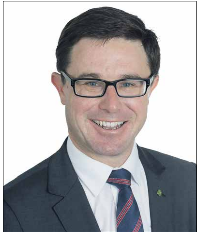
Minister for Agriculture and Water Resources, David Littleproud MP.

Landcare will continue to deliver the results that have made this movement such an iconic part of many rural and regional communities.