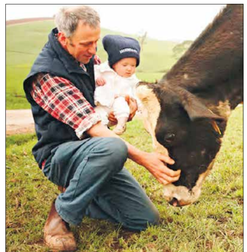
Dairy farmer with child.

The Australian government's National Landcare Program Phase Two has allocated $134 million for Smart Farms Small Grants and Smart Farming Partnerships.