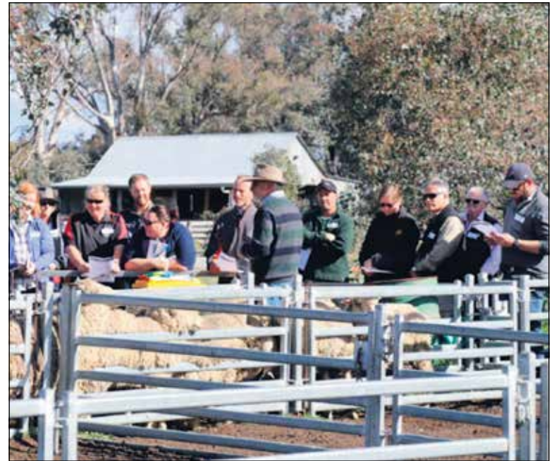
Participants at a Sheep Husbandry For Small Farms field day in Hall, ACT.

"Caring for the land seems too hard when you have little or no knowledge, having a place to go to learn makes it so much easier."