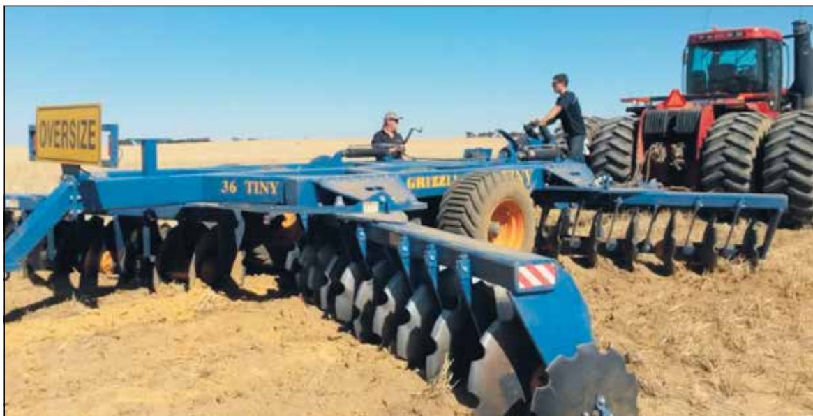
Ameliorating acid soils with lime - 91.44 cm offset disc plough used to incorporate lime into acid soils.

IT IS fairly well known that by world standards, Australia's soil is old, infertile and we don't have a lot of it.