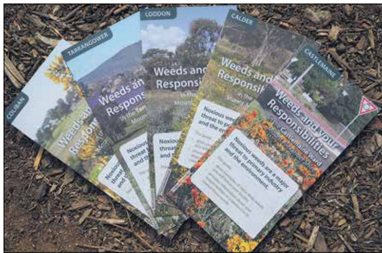
The Tarrangower Cactus Control Group has produced some new weed control brochures.