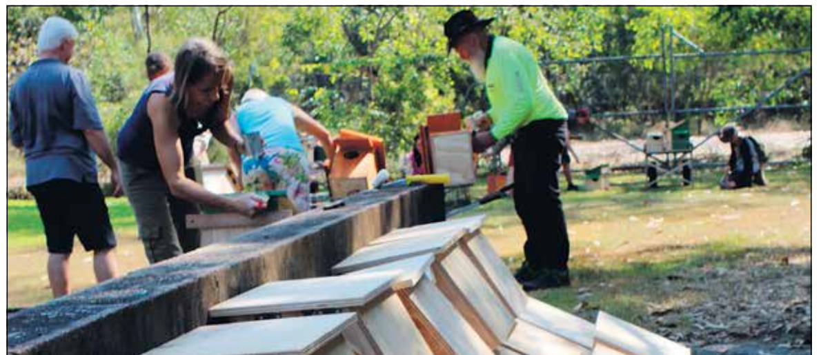
The nesting boxes were all constructed by the Palmerston's men shed.